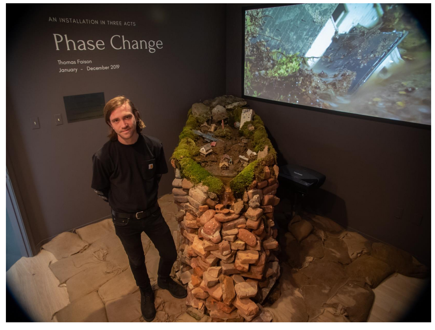
Figure 1 Phase Change: Act I

Figure 2 Snippet from Phase Change: Act II