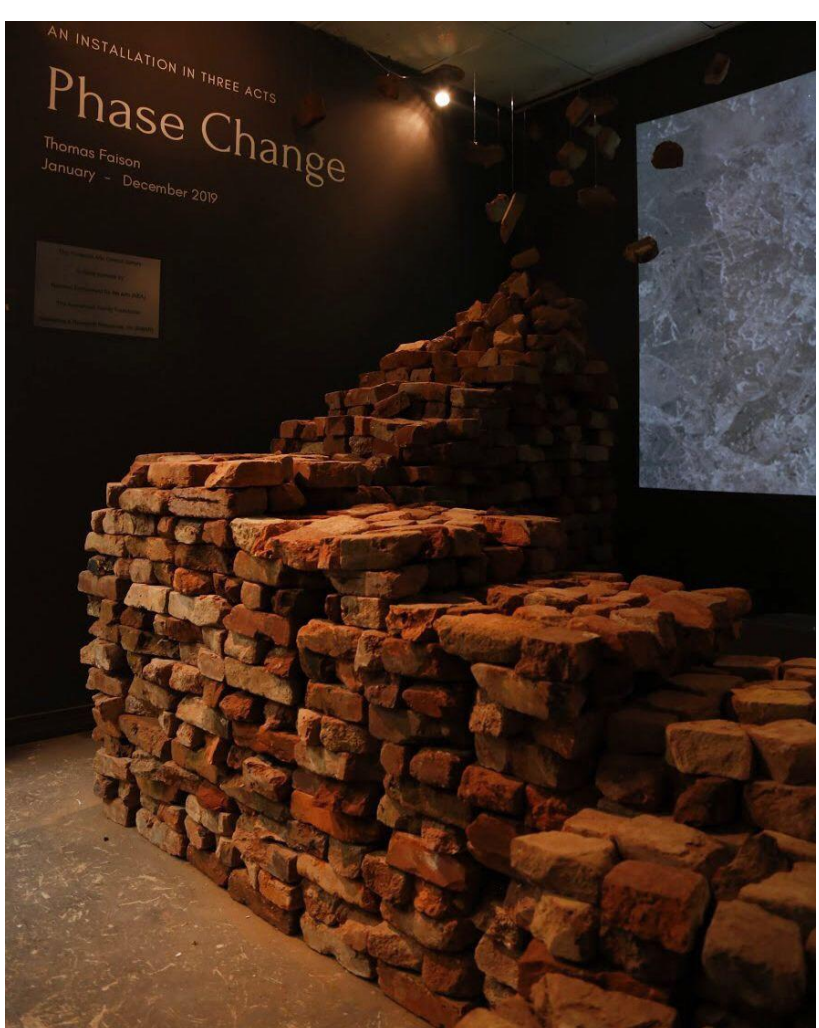
Figure 4 Phase Change: Act III