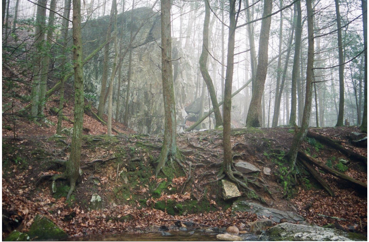
Figure 3 Photograph by Ashley Hoffman as collaborative artist with Thomas Faison on "Phase Change"