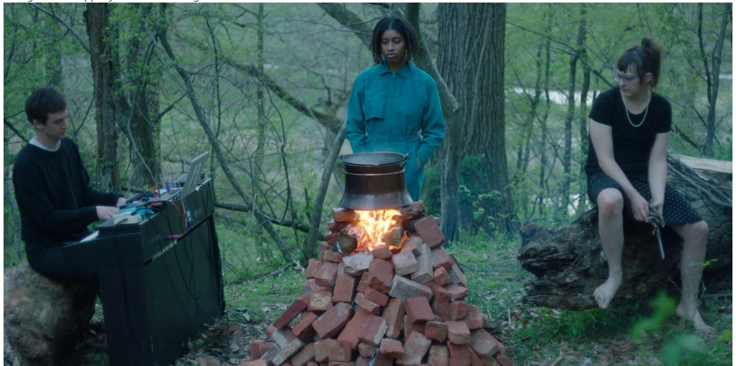
Figure 2 Snippet from Phase Change: Act II