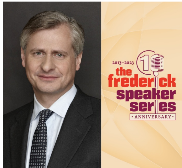
Frederick Speaker Series JON MEACHAM SUN NOVEMBER 20, 2022 | 3:00 PM

The silent film era returns to our screen accompanied by the mighty Wurlitzer! Learn More