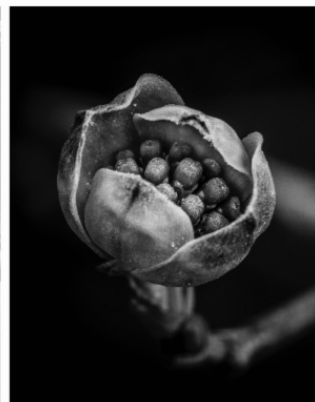
ED PALASZYNSKI Life Forms Photography Nov 5 - Dec 31

NOVEMBER 2022 EXHIBITIONS • PROGRAMS • WORKSHOPS