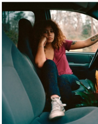
NATIONAL JURIED PHOTOGRAPHY EXHIBITION Photography Nov 5 - 27