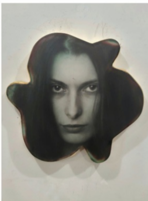
SEAN DUDLEY Accretion Photography and mixed media Nov 5 - Dec 31