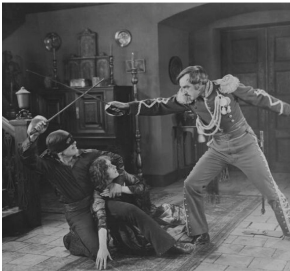
Silent Film Series The Mark of Zorro (1920) SAT NOVEMBER 19, 2022 | 3:00 PM

For more information & events, visit weinbergcenter.org .