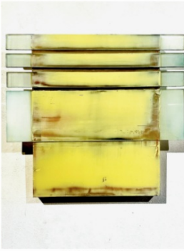
JOE GERLAK Explorations of Light and Shadow Mixed Media May 4-Jun 30