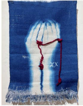
NATIONAL JURIED EXHIBITION Works in a variety of media May 4-July 7