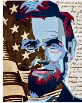
EUNICE TURNER Lincoln's Triad: A Visual Chronicle of History Mixed Media on Wood May 4-Jun 30

MAY 2024 EXHIBITIONS • PROGRAMS • WORKSHOPS