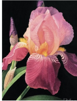
METRO WASHINGTON CHAPTER OF THE COLORED PENCIL SOCIETY OF AMERICA The Power of Color Feb 1-23