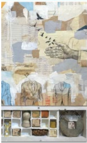
2019 NATIONAL JURIED EXHIBIT Works in a variety of media May 4 - Jun 16