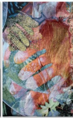
STEVEN DONEGAN Garden Phase Digitally woven textiles May 4 - Jun 30