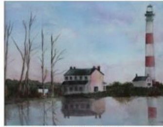
by Starr Myklebust