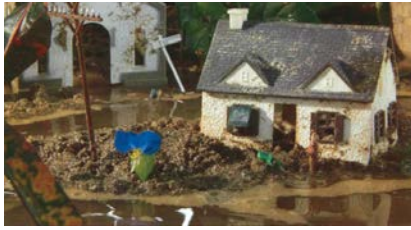
From "Memento Mori" flood simulator project

show, entitled "Unified Dissonance," at the Blue Elephant Gallery in the Griffin Art Center, and his films have been featured in film showcases and festivals in Baltimore, Ann Arbor, Chicago, and Frederick. His installation artwork has been featured in artist run spaces throughout Baltimore and he is the co-founder of the Baltimore Student Film