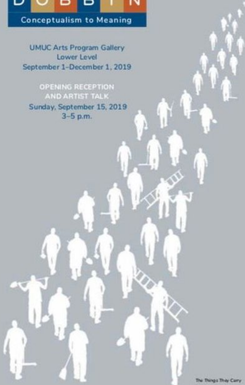
The Things They Carry 2017 steel and paint 21 x 7 feet

OPENING RECEPTION AND ARTIST TALK Sunday, September 15, 2019 3–5 p.m.