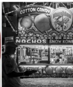
KAREN COMMINGS Last Call Photography Through Sep 1