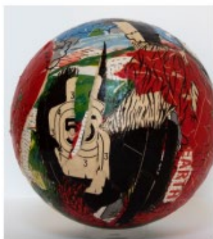
LISA TARKETT REED Inner/Outer Space Mixed-media drawing & sculpture Through Sep 1