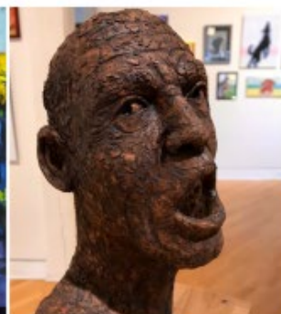
OVER 70 SHOW Various artists Works in a variety of media Aug 3 - Sep 1

AUGUST 2019 EXHIBITIONS • PROGRAMS • WORKSHOPS