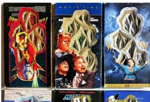
Exhibit Featuring 1980s and 1990s Objects on Display at Hood College

An art exhibition of hand-cut paper sculptures integrated with found objects from the 1980s and 1990s will be on display Aug. 29 through Oct. 20 at Hood College.