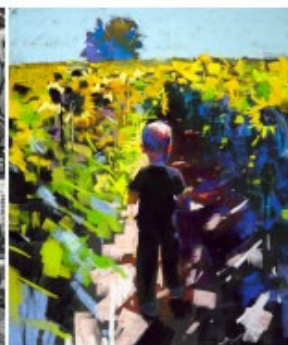
TARA WILL The Radiant Pastel Plein air pastels Through Sep 1