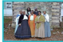
WASHINGTON REVELS JUBILEE VOICES

Saturday, February 8th @ 2:00pm & 7:30pm $24 Youth/ $32 Adult